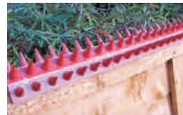
Fences Prikka-Strip's triple hinges allow it to be fitted over fence tops giving side coverage too!