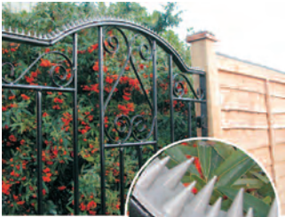
Gate tops Prikka-Strip makes gates even more difficult to climb over.