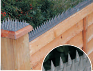
Fences Prikka-Strip's unique double-hinge design fits weatherbar profiles.