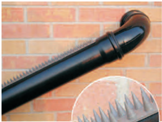
Pipes Fit Prikka-Strip to external pipes to protect your property still further.