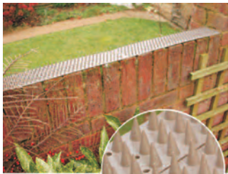
Walls Prikka-Strip can be fitted side-by-side to increase the effect.