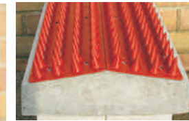
Double-up for wider applications.